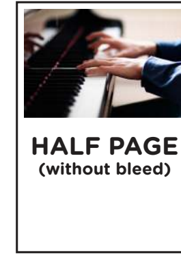
HALF PAGE (without bleed) HEIGHT 95 mm WIDTH 138 mm