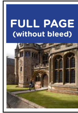
FULL PAGE (without bleed) HEIGHT 200 mm WIDTH 138 mm